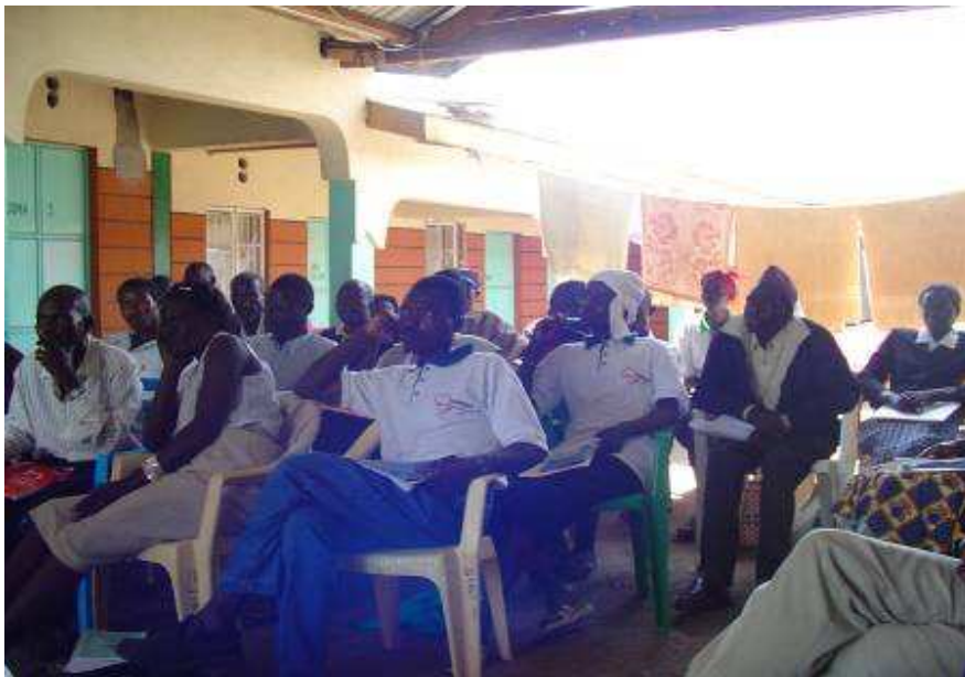
Hope and Life collaborates with other organizations such as AMREF to coordinate trainings and lectures.