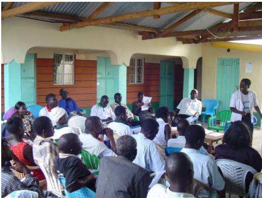
Hope and Life Team Members leading a discussion on Living Positively to a Community Group.