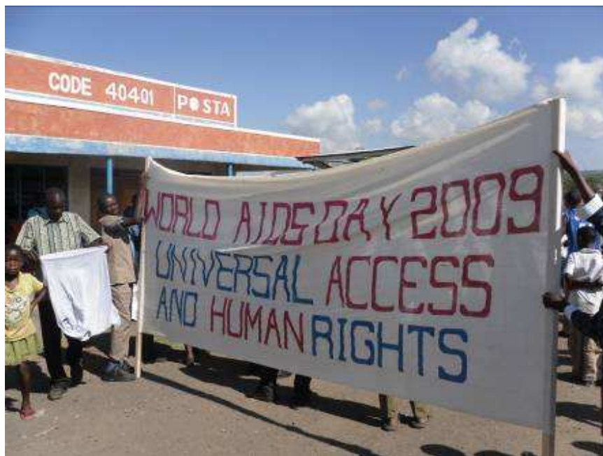
Hope and Life played a vital role in organizing and coordinating World AIDS Day 2009 in Karungu.