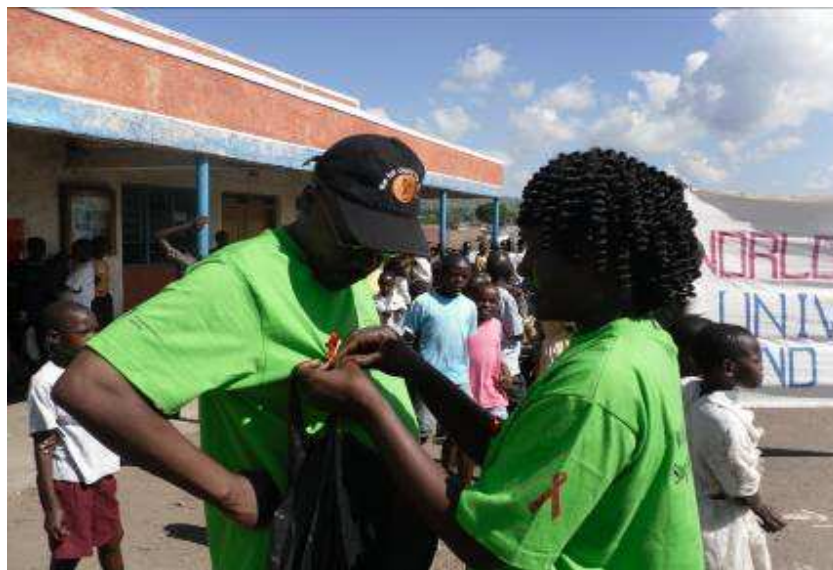
Hope and Life provides a healthy and supportive for PLWHA such as organizing a march and ribbons for World AIDS Day.