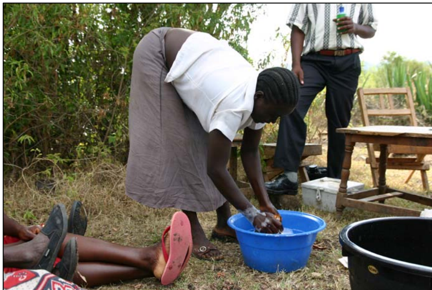
Fig. 2: A member of Hope&Life wash her clothes with the detergent soap produced by the group