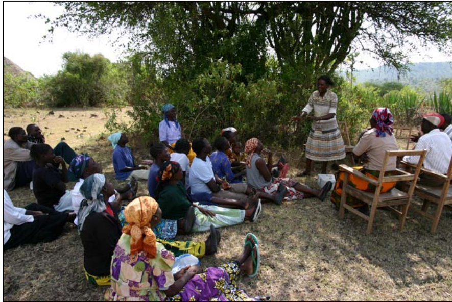
Fig. 1: A moment of group formation