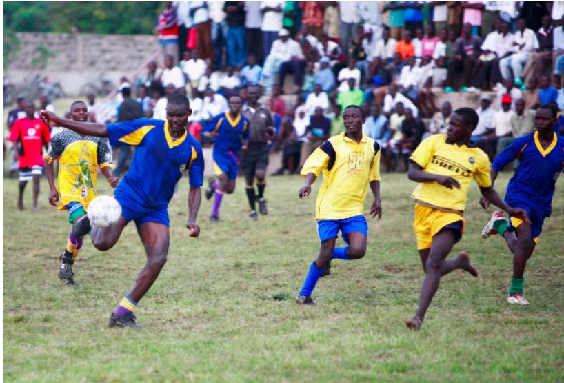
Part of the action during the WAD 2006 football tournaments