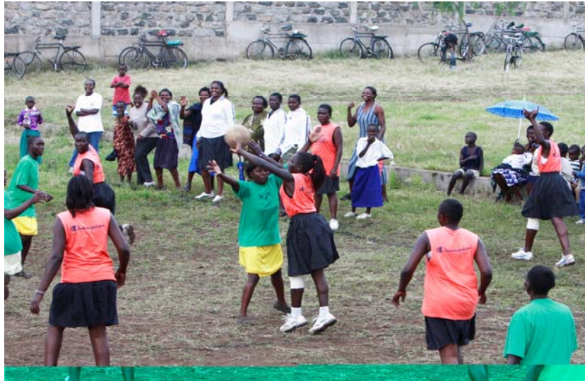
Part of action during the WAD 2006 netball tournament