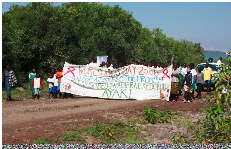
Participants of the WAD 2006 take part in procession

This marked the commencement of WAD 2006. The twin processions kicked off at around 8.00 am and ended at about 9.30 am. The starting points of the processions were Oodi and Sori beaches respectively and each was approximated 3km away from the finishing point (St. Camillus Dala Kiye), which also doubled as the venue for the WAD 2006 celebrations. Over 1500 community members and school going children joined hands and participated in these processions. A number of IEC materials were distributed at each starting point to the expectant participants. This was mainly intended to pass information and raise awareness to the local communities on HIV/AIDS pandemic. The area D. O. at Sori beach and the area Chief at Oodi beach respectively flagged off the processions. The participants carried banners, flags and sang songs, which bore educative and informative messages on the HIV/AIDS pandemic. For each procession, a vehicle with well-fitted public address system played educative tunes about AIDS and passed pieces of information regarding the events for the WAD 2006. The processions entered the venue of the celebrations at around 9.30 am to a tumultuous reception by the already seated audience numbering hundreds