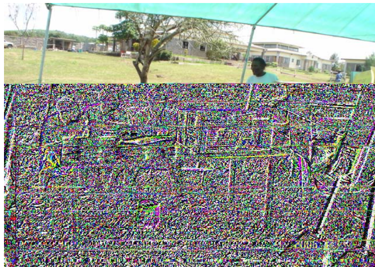
Participants of WAD 2006 pay close attention to a project Staff when they visited MOSUP project stand