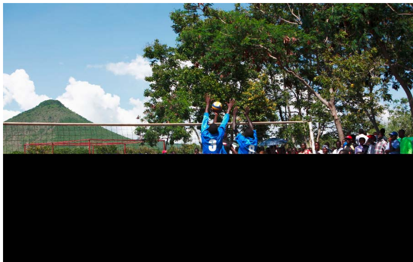
Part of the action during the WAD 2006 volleyball tournament