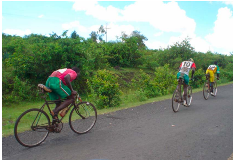
It is a cutthroat encounter between the various competitors In the WAD 2006 bicycle riding competition

Presents were awarded to the top five finishers in the following descending order; a brand new bicycle, bicycle frame, two bicycle wheels, two bicycle tyres and two bicycle tubes.