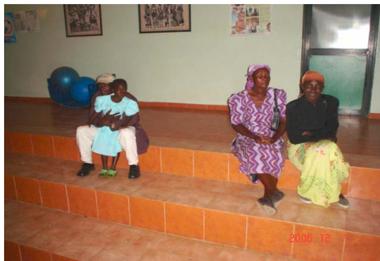
Participants of the WAD 2006 line up to visit VCT

The counselors ensured that there was adequate publicity prior to the event and this was reflected on the high turn up of clients during the three days in which the exercise was conducted.