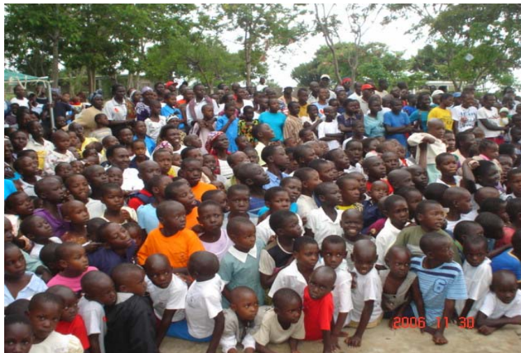
Attendants of WAD 2006 gather at the Dala Kiye grounds in readiness for the opening ceremony