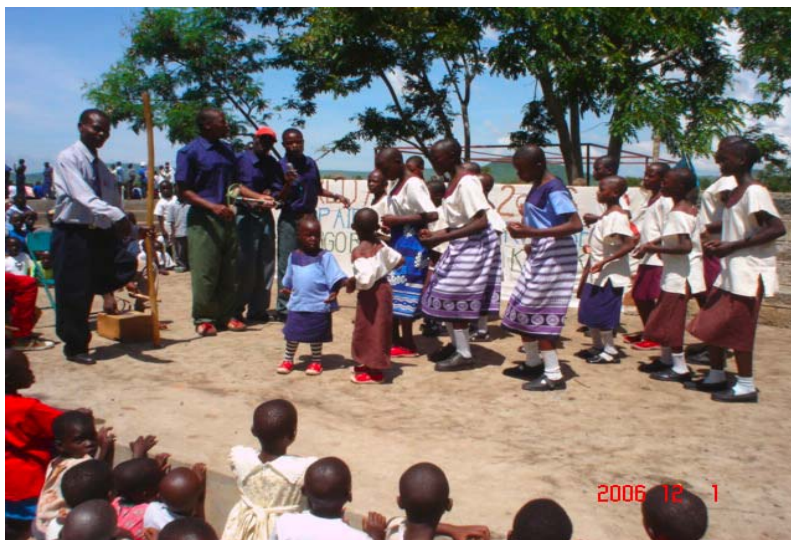
Children from Sally Orphanage educating participants on HIV/AIDS and situation of orphans in the community