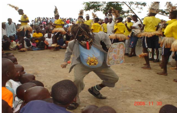
It is all song and dance to mark the official opening ceremony of WAD 2006